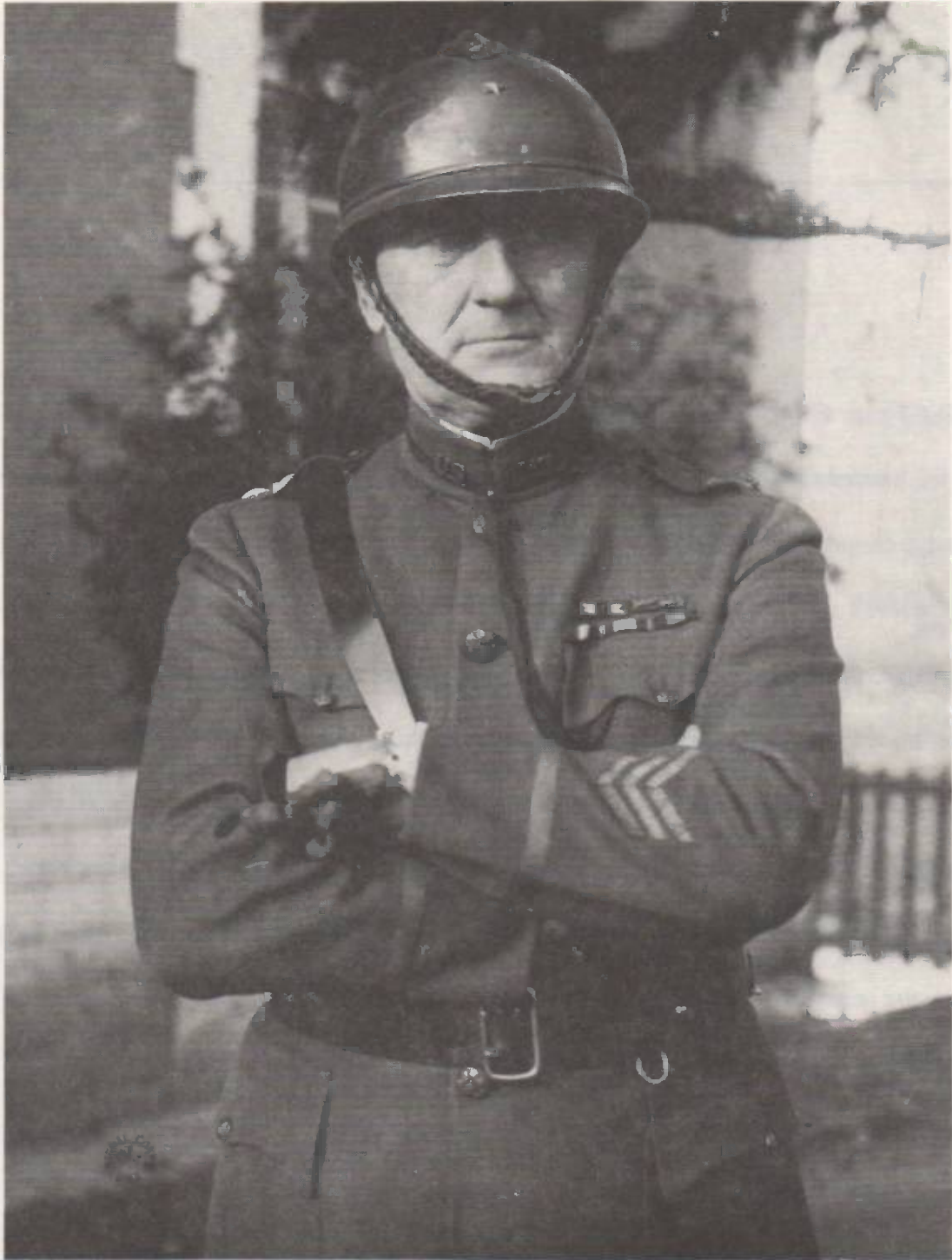
Brigadier General James G. Harbord, U.S. Army, commanded the 4th Brigade of Marines at Belleau Wood and other major battles, until he was given the nod by General Pershing and promoted to 2d Division commander in the American Expeditionary Force. He took the division into battle at Soissons.